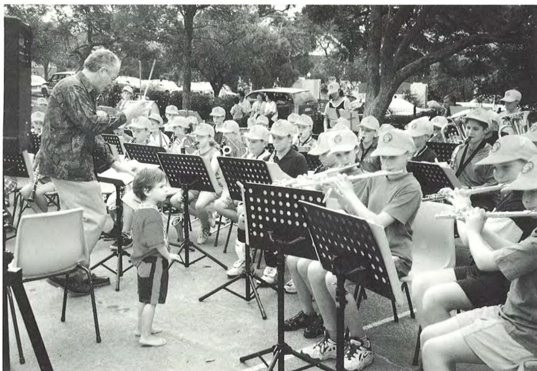
The Senior Band, 1998.

A computer laboratory with thirty computers and a mini computer laboratory in the library with fifteen computers have been established. There are computers in every classroom, which ensures that all children in the school have access to the latest technology.