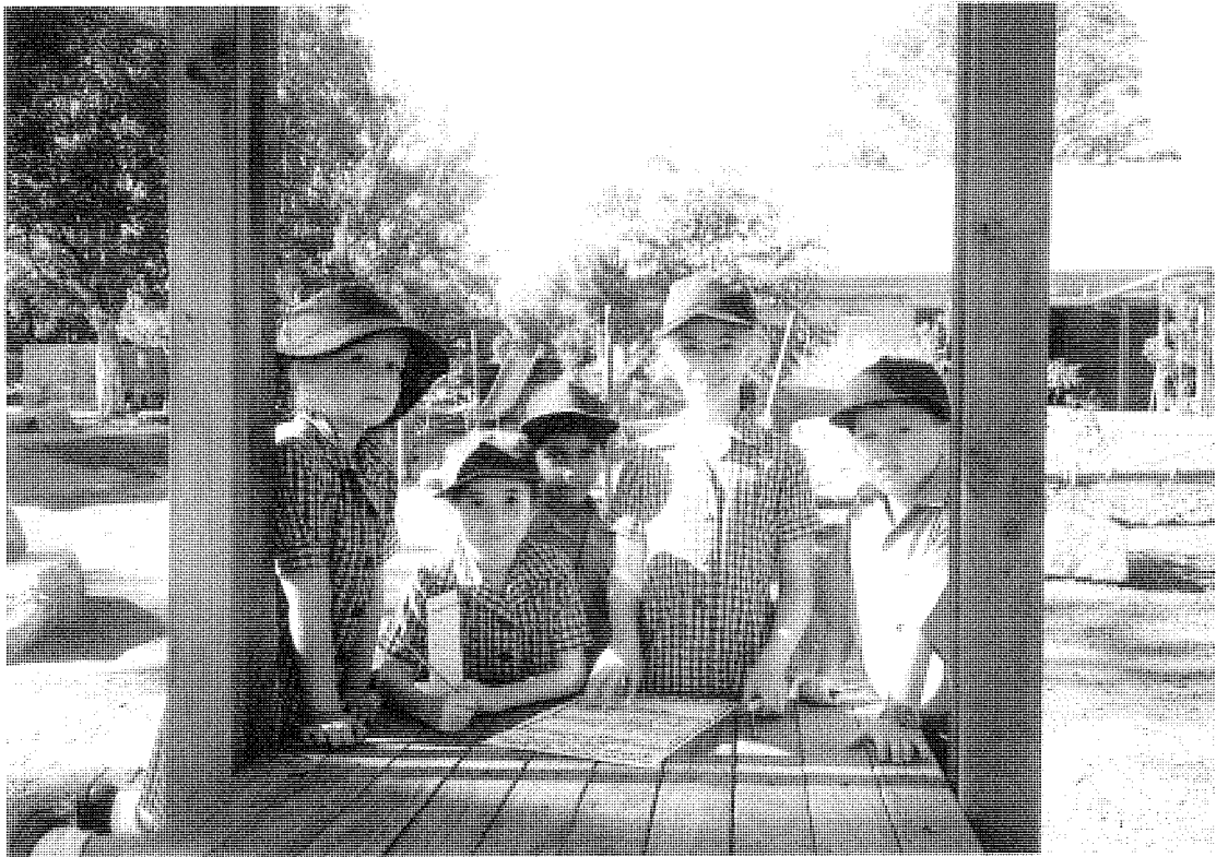
Outdoor learning area, 1998.