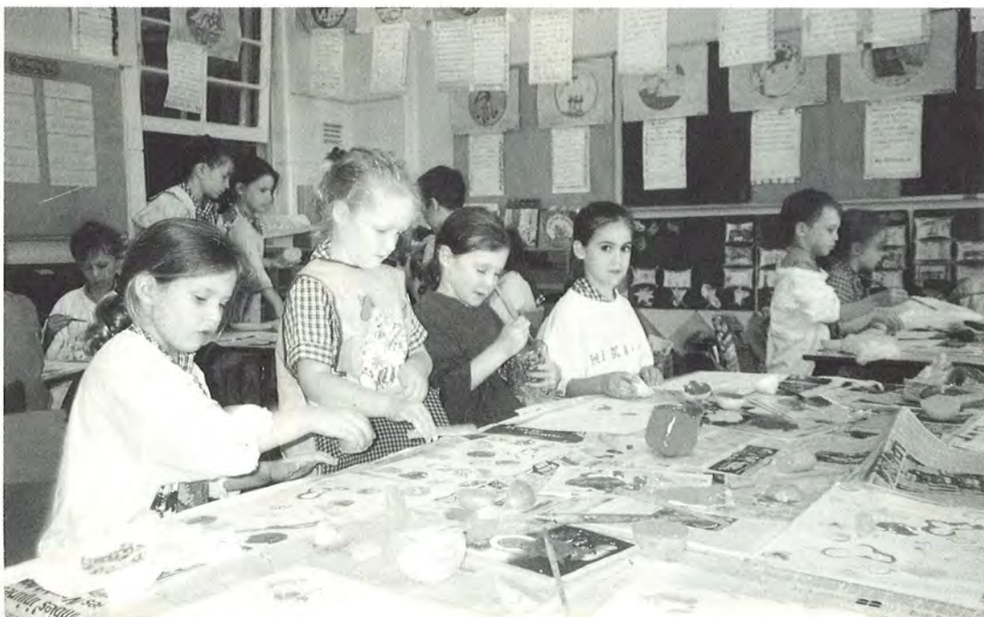
Art activities in the class room, 1998.

Students have the opportunity to join dance and drama groups, the debating team, the choir and the highly successful band programme.