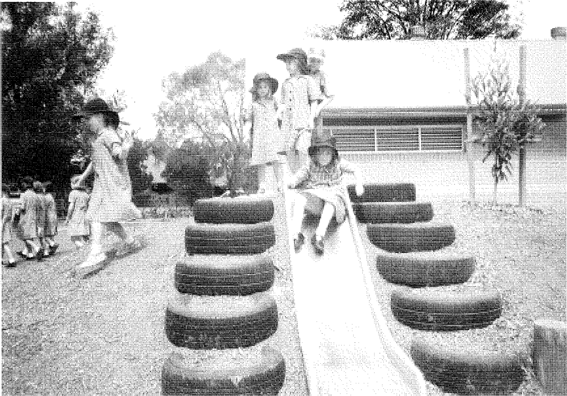
School grounds, 1998.

The Parents' and Citizens' Association funded landscaped gardens, which includes open play areas, providing an imaginative play space and outdoor learning areas. Parent working bees maintain the grounds.